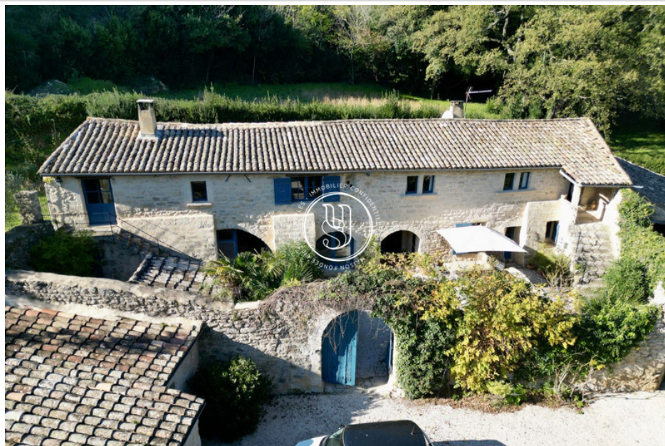
Mas 3878 Uzès